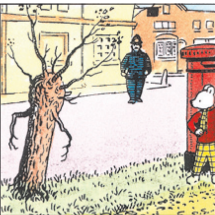
It buries all its roots once more, Then stands quite stiffly as before.

Call costs £1.53 per min and lasts 3 mins Network extras apply. Max call cost £4.60.