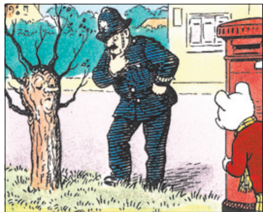
The man exclaims in great surprise, "That tree must not stay there," he cries.

"What a weird place for a tree," he mutters gruffly, "and why have I never noticed it before? I could declare it wasn't here yesterday. Anyway, it must be cut down. It will interfere with traffic if it grows bigger. I'll go and tell the town clerk about it at once."