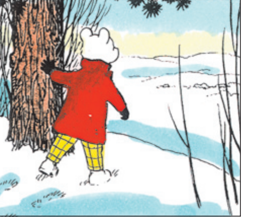
Round Popton all is white as milk

With crisp fresh snow, as smooth as silk.