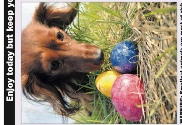
WARNING: Smallest animals are most at risk

Enjoy today but keep your four-legged friends away from the Easter egg hunt