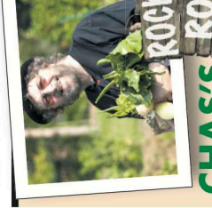
ROCKIN' CHAS'S ROLL-ALLOTMENT

The actual names of all these varieties catalogue but will keep you up to date on what I sow, and report on the progress. Don't know if you remember but I grew